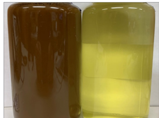
Inlet: Avg 951ppm | Outlet: Avg 11ppm